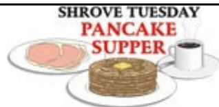
SHROVE TUESDAY PANCAKE SUPPER

The Knights of Columbus, Council 1626 will be having their Annual Shrove Tuesday Pancake Supper on February 24th . The supper will be at St. Mary's parish in the hall from 4:00 p.m. to 7:00 p.m. Tickets are $5.00/person or $15.00/family and will be sold at the door.